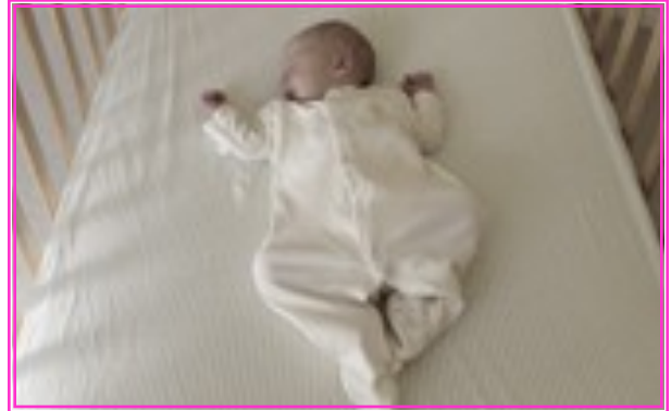
Bare is Best

More than 11 million cribs have been recalled because of safety hazards in the United States since 2007. The CPSC changed federal manufacturing standards for cribs in June 2011. The new rules, which apply to full-size and non-full-size cribs, prohibit the manufacture or sale of traditional drop-side rail cribs, strengthen crib slats and mattress supports, improve the quality of hardware and require more rigorous testing. Read more about the details of the crib manufacturing rules.